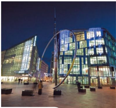
Cardiff City Centre