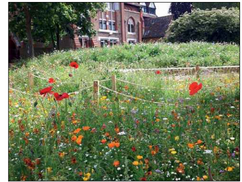
Wildflowers create a bio-diverse habitat supporting birds, mammals, bees, butterflies and other invertebrate species.