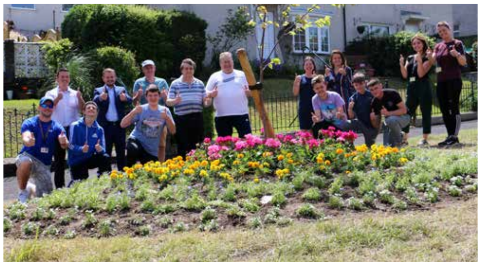
Pupils from Blackwood Comprehensive School planting donated flowers.