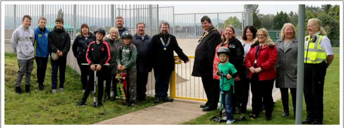
Young people enjoying the new skate park in Penyrheol's Aneurin Park