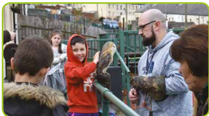
Visitors meeting the owls from Ebbw Vale Owl Sanctuary at the Phillipstown Shape Your Place event.

Lots of you have been meeting with us and giving your views over the past few months at a number of 'Shape Your Place' consultation events and activities held throughout the county borough. This consultation has been held as part of our Welsh Housing Quality Standard (WHQS) Environmental Improvement Programme.