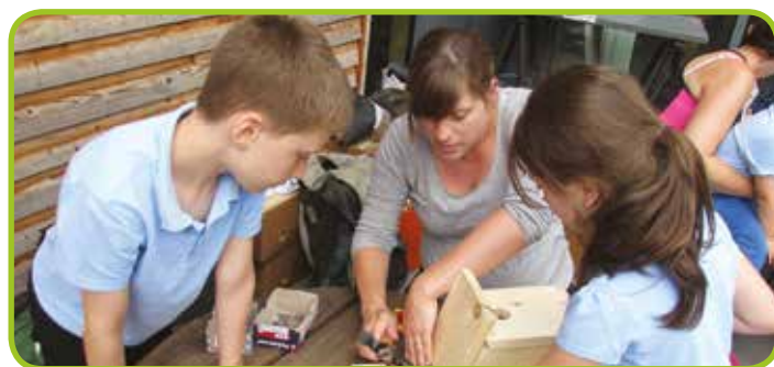
Bird box making at the Penyrheol Shape Your Place event.

For more information or to give ideas for how your local area could be improved search for 'WHQS Environmental Improvement Programme' at www.caerphilly.gov.uk or contact the officers on 01443 864398 / 866231 / 864002.