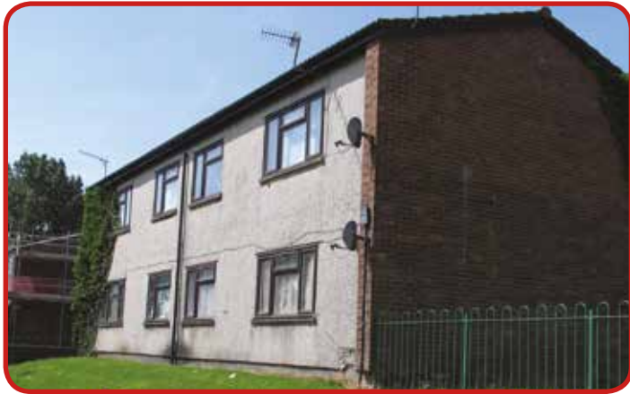
Homes in Lansbury Park before energy efficiency works.

December saw phase 2 begin on the programme to improve the energy efficiency of homes in Lansbury Park. This work will not only transform the appearance of properties and the estate, but will also help to address fuel poverty by making homes more thermally efficient whilst also reducing the impact of carbon emissions.