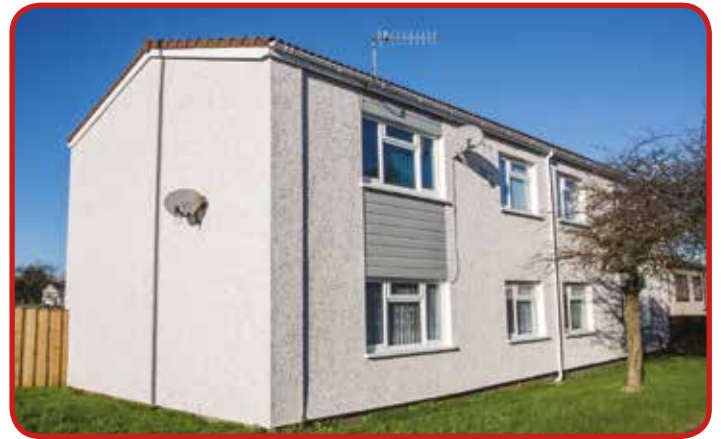
Lansbury Park homes after energy efficiency works.