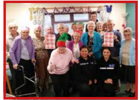
Crackers & Crime event at Pleasant Place, Penyrheol.

A list of trips for 2018 can be found over the page and also on your scheme's communal noticeboard. If you'd like to visit somewhere that isn't on the list please let me know and I will try, wherever possible, to run additional trips.