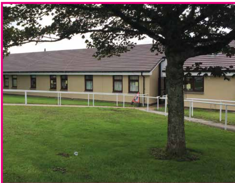
St Clare's, Rhymney.

We are also continuing with coffee mornings and afternoon tea events in schemes where surveys are about to begin. These events offer you the opportunity to meet the team responsible for delivering the WHQS programme in sheltered housing and to ask any questions you may have about the work.