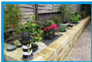
The winning garden at Maesteg.

Our Older Person's Housing Team has a new contact telephone number. You can now reach them on 01443 811431 .