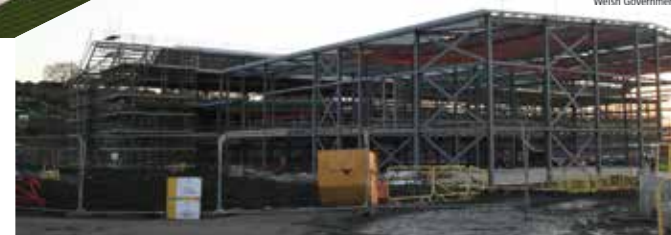
Progress at the Islwyn High School site.

Development of the impressive campus, which houses both Ysgol Gynradd Gymraeg Caerfilli and part of Ysgol Gyfun Cwm Rhymni, will enter its the final phase shortly, with the construction of a new 3G artificial sports pitch and multi-use games area on the site. These ambitious projects are part of the 21st Century Schools programme, led across Wales by the Welsh Government and have been made possible thanks to match funding from the Welsh Government.