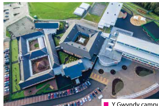
Y Gwyndy campus