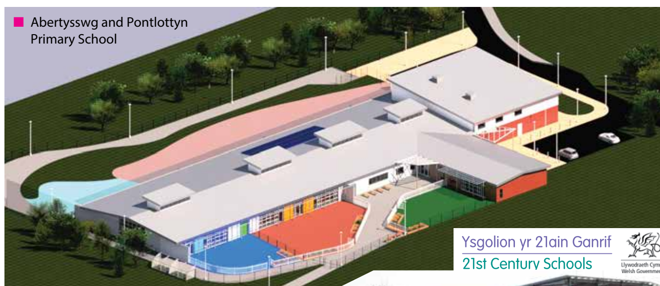
Abertysswg and Pontlottyn Primary School

Work is also progressing at quite a pace at the Islwyn High School development in Oakdale, with the building frame now complete and the roof soon to be in place. Once complete, the school campus will house pupils from Oakdale and Pontllanfraith Comprehensive Schools. The development will see a range of teaching spaces, including state of the art science and technology labs, as well as a 3G pitch, 200 metre athletics track and multi-use games area.