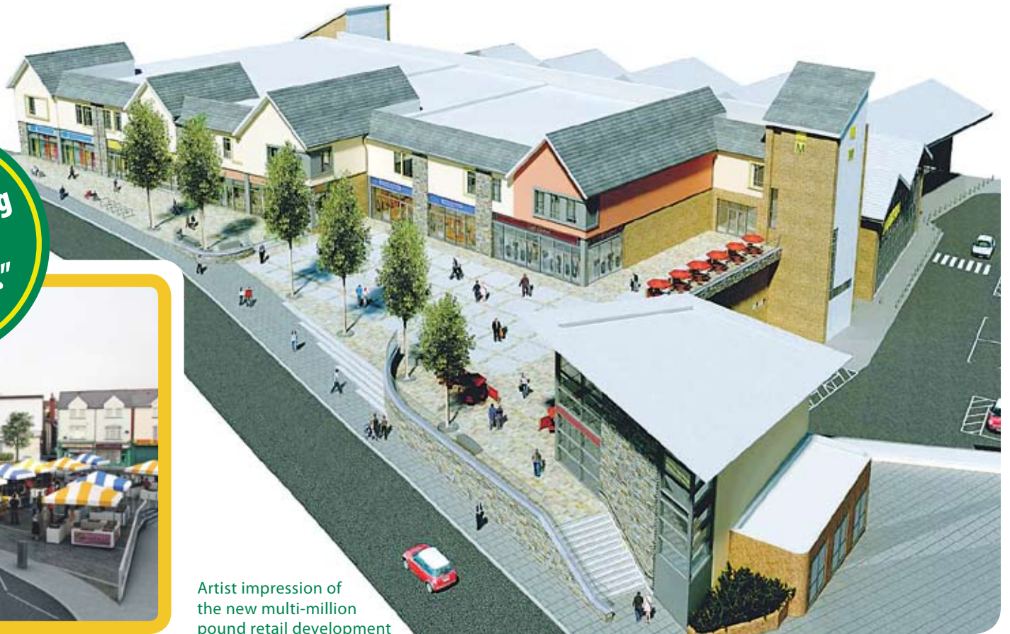
Artist impression of the new multi-million pound retail development