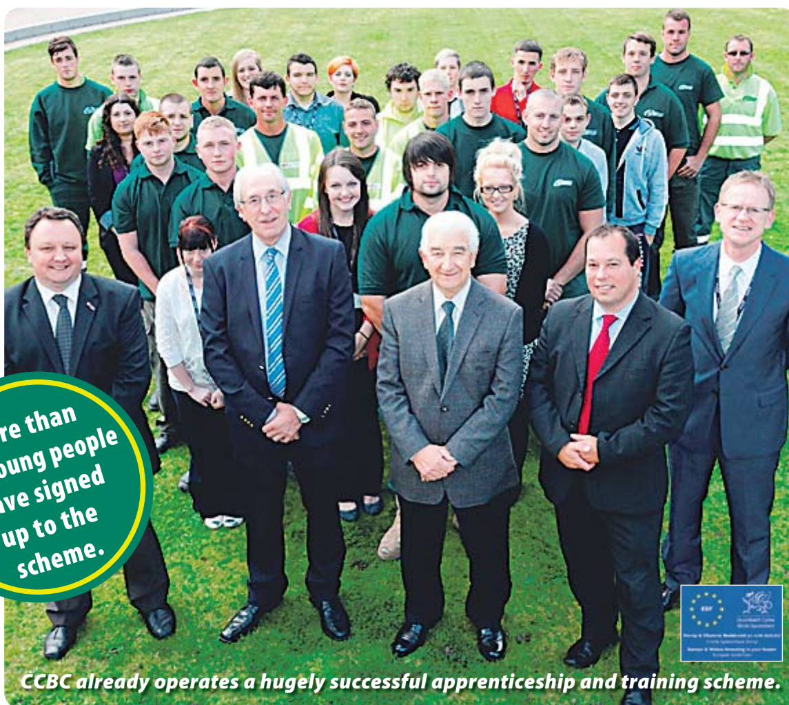
CCBC already operates a hugely successful apprenticeship and training scheme.

Over the past year alone more than 260 young people have signed up to the popular scheme as a work placement, apprenticeship or trainee, helping them get onto the career ladder and gain valuable work experience.