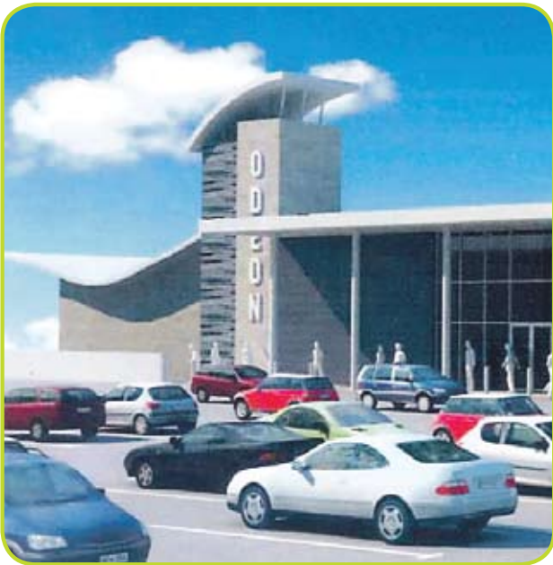
■ Bargoed New Multiplex Cinema