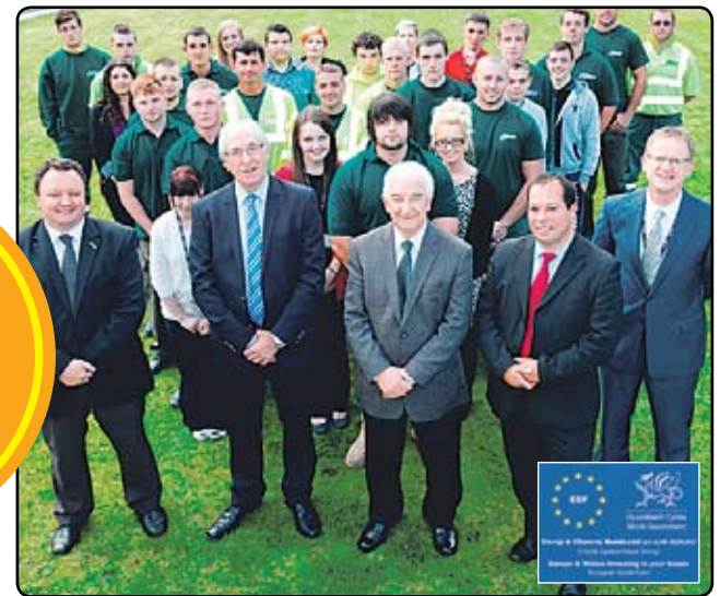
CCBC already operates a hugely successful apprenticeship and training scheme.

For more information contact: 01443 866752