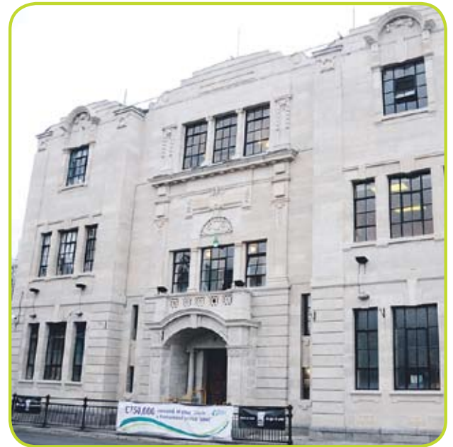
■ Blackwood Refurbishments at Miners' Inst.