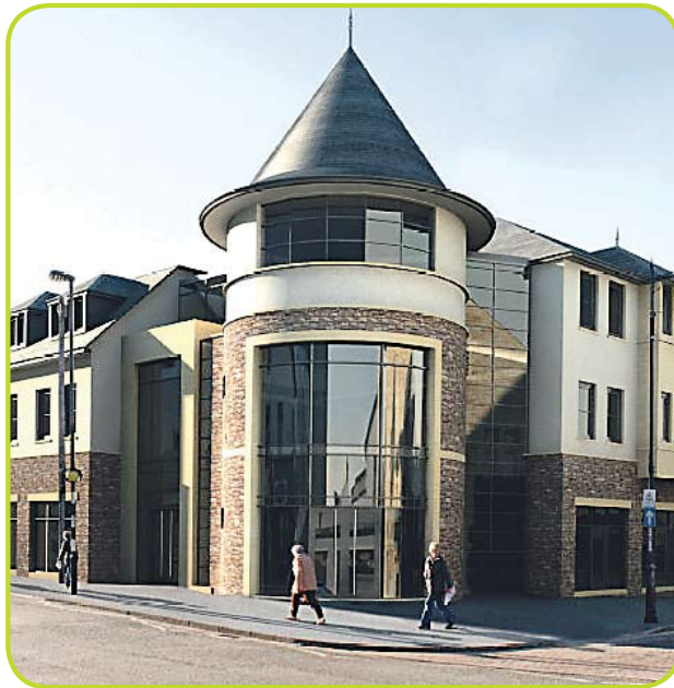
■ Caerphilly Library & Customer service centre