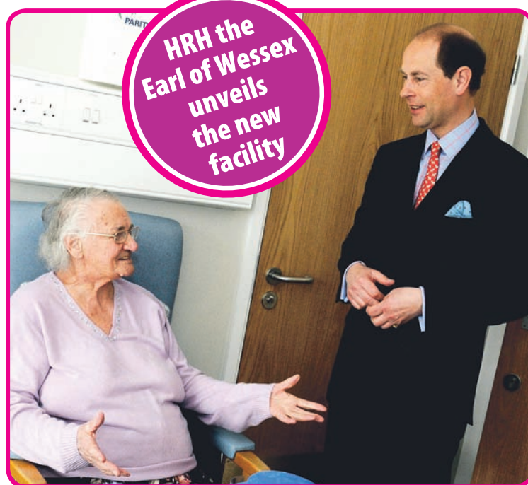
HRH the Earl of Wessex unveils the new facility

A community forum, made up of local residents, voluntary organisations, elected members and health and social care professionals were involved in the planning of this impressive development, ensuring a local say on the facilities offered.