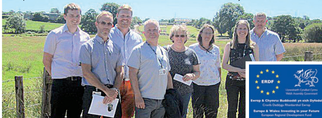
Representatives from CCBC, Welsh Government and Walters at the Ty Du site in Nelson.

"I am delighted that Welsh Government is now in a position to appoint contractors for the Ty Du site. They will undertake vital work that will construct the roads and provide the services necessary for development of the Ty Du site, providing valuable jobs in the construction phase and helping to make the site an attractive proposition for businesses and future home owners alike."