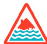
SEVERE FLOOD WARNING

The Environment Agency issue warnings by;