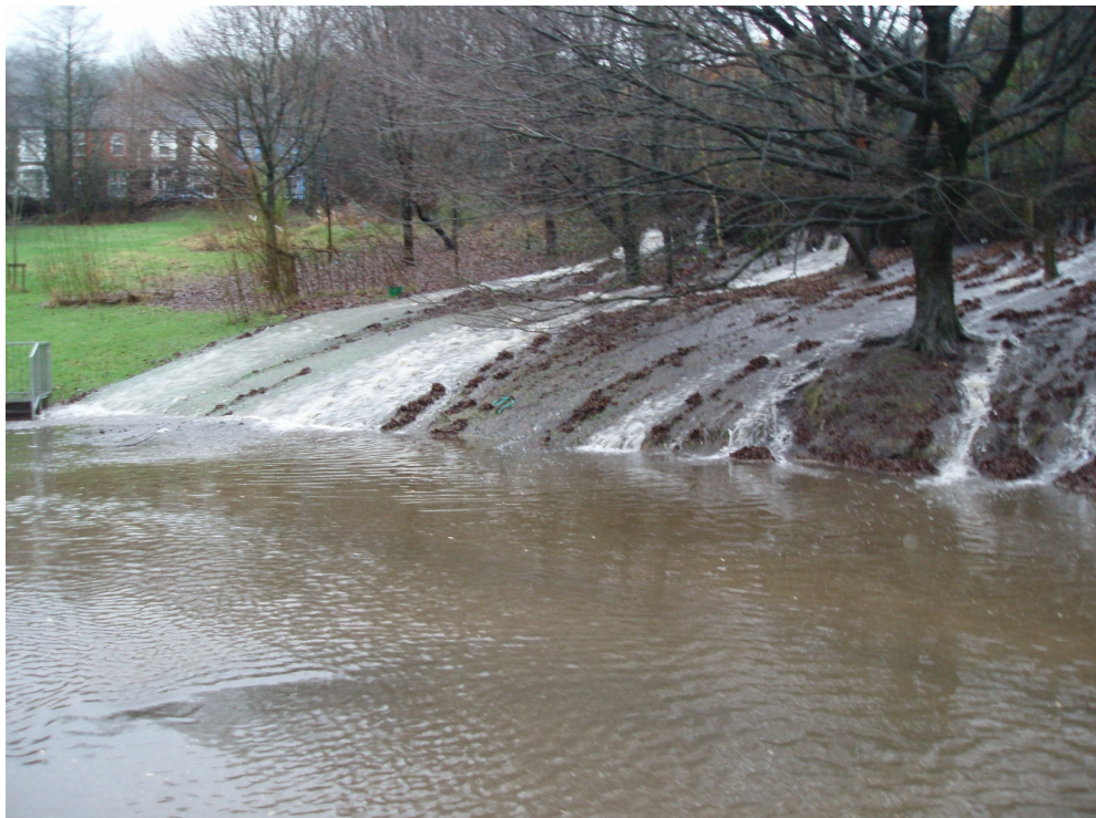
Surface Water Flooding

Increases to the runoff characteristics of the catchment may be caused by farmers ploughing at right angles to contours rather than parallel to them, removal of top soil, removal of vegetation including the felling of trees or other site clearance. Runoff will be altered if an area is subject to a new development such as housing. These issues are all likely to give rise to increases in surface water flows. Controls will be imposed to restrict the maximum rate of runoff from these developments to a level no greater than the existing although the total runoff may increase.