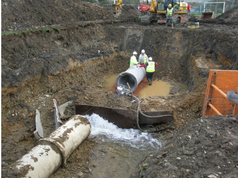
Sub-standard culvert being replaced