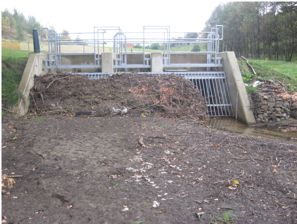
Blocked grid following heavy rain