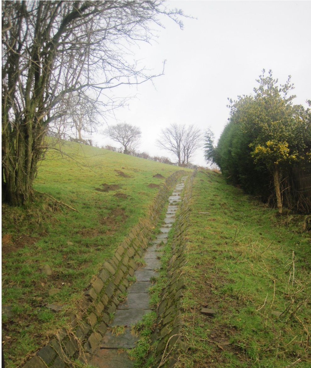
Matured Drainage Channel