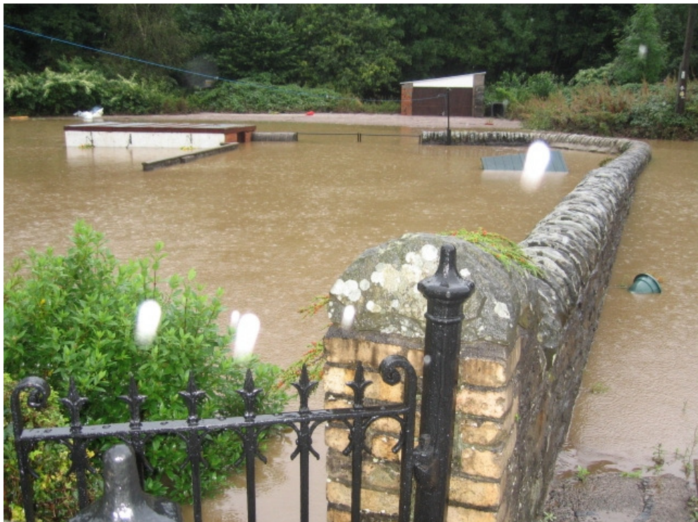
Flooding from a Blocked Culvert in an Ordinary Watercourse