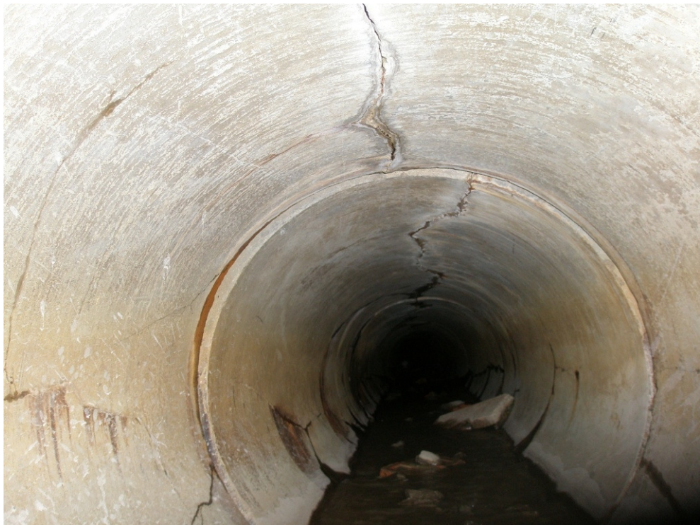
Funding required to replace aging culverts