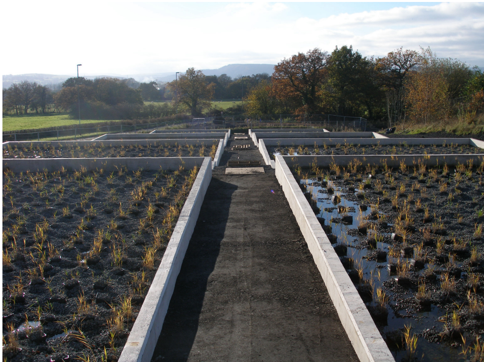
Construction of Reed Beds