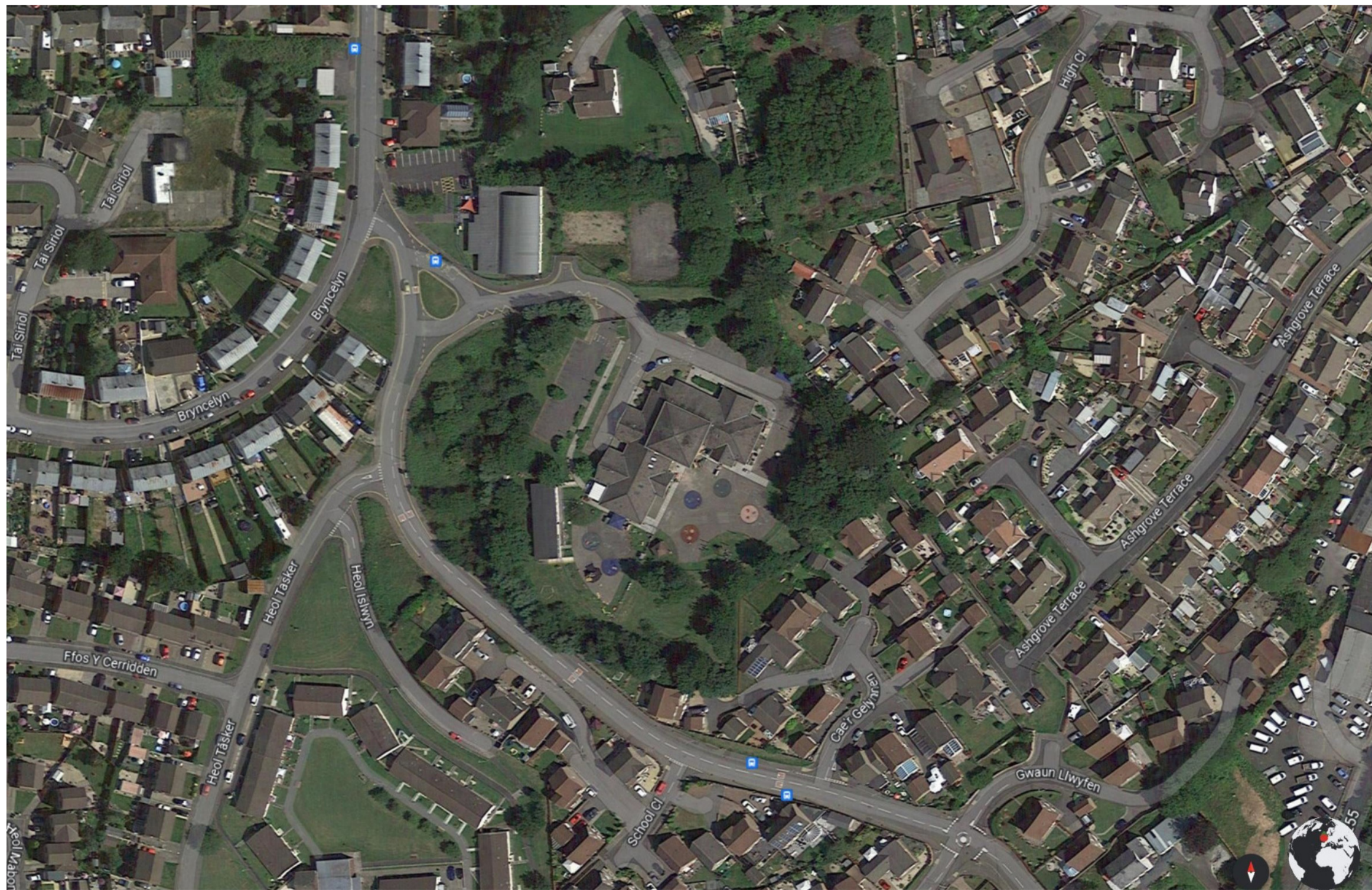
Delwedd Google Earth o'r safle yn ei chyd-destun