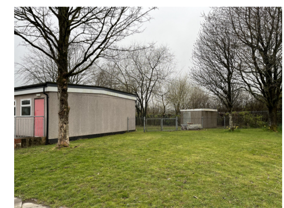
Buildings 1381 (on left) & 1793 (on right)