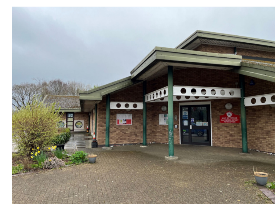
School Entrance - Building 329