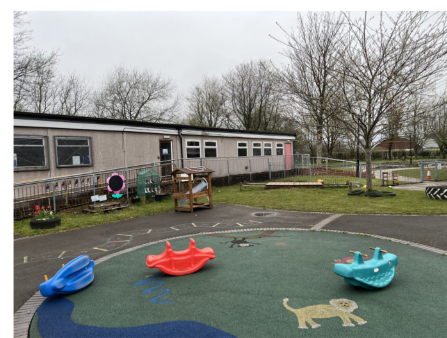
Buildings 1381 (on right) & 1382 (on left)